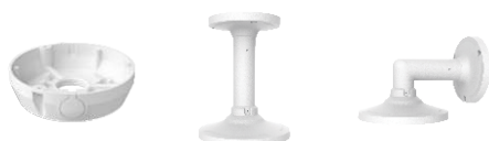
TD-YXH0201 TD-YZJ0802 TD-YZJ0402